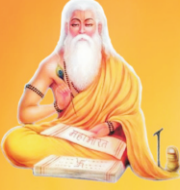
श्री वेद व्यास