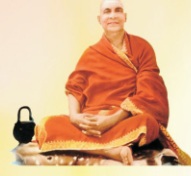
स्वामी शिवानन्द सरस्वती