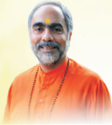
स्वामी स्वरूपानन्द सरस्वती